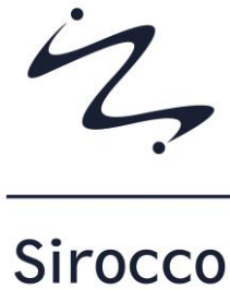
Table d'Hôte Menu